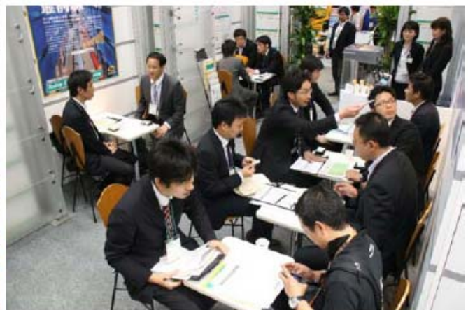
Enthusiastic business deal negotiations were underway in the booths.