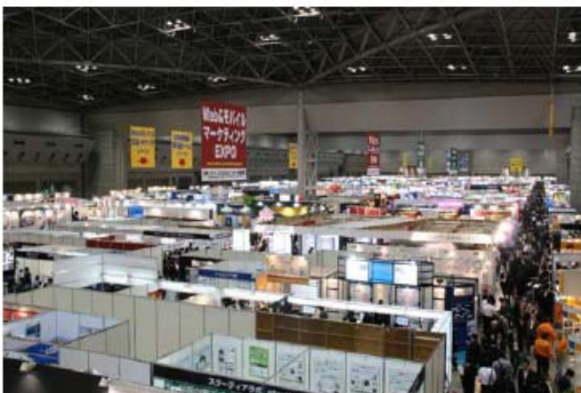
The show used both of the East and West Exhibition Halls.

Starting opening day, there were long lines in front of the ticket counters and the exhibition halls were filled with visitors, who looked for technical support or considered implementing new systems or products into their business. At the same time, exhibitors showcased state-of-the-art products and technology and also set up business meetings to grasp the new and best business opportunities. We saw many exhibitors have concrete business meetings with users and receive significant sales results. The seminars held along with the show had a record number of 19,296 attendees and attracted the industry's attention.